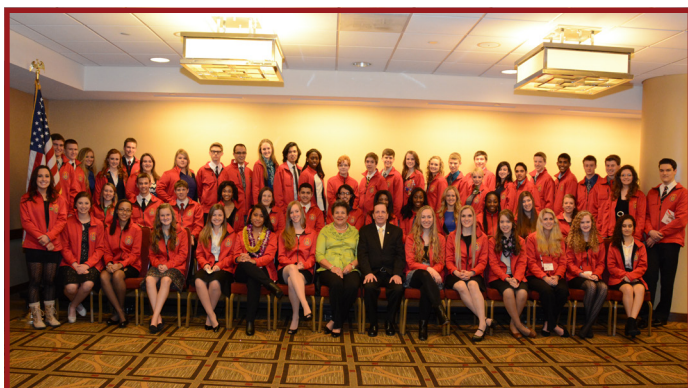
The 2014 Voice of Democracy winners during their awards ceremony in Washington, D.C.